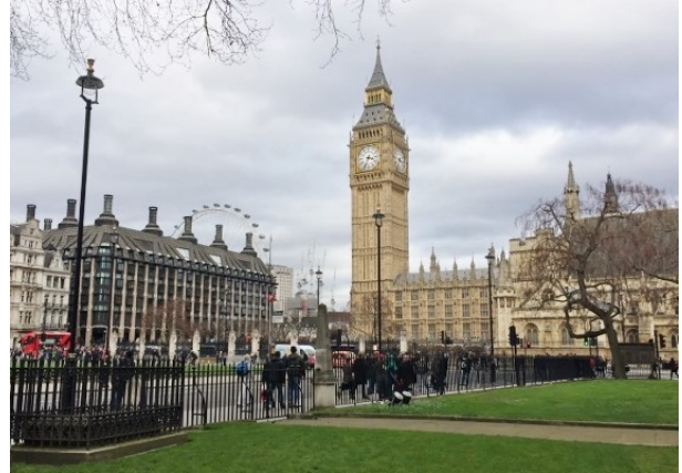
Big Ben.

Second Place: Emma Staats, Sophomore, Criminal Justice " Falling in Love with London " WU Faculty-led Program: Art and Theater in London/Global Communications - London, Spring Break 2017