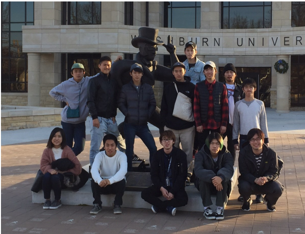
Fall 2017 short-term international students from Chiba University of Commerce-Chiba, Japan.

From October 14-December 9, 2017, WU welcomed the second exchange group of Global Studies majors from Chiba University of Commerce (CUC) in Chiba, Japan. This year's group of thirteen students explored the WU campus, Topeka community and beyond (including Kansas City area and the National Tallgrass Prairie Reserve near Strong City), while taking Intensive English classes, observing WU academic classes and experiencing the Thanksgiving traditions first-hand with their host families.