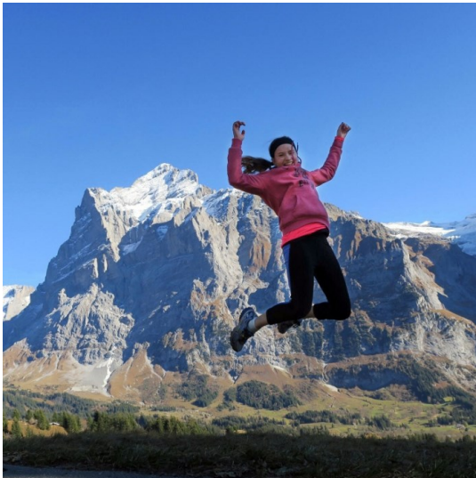
Alpine Jumping.