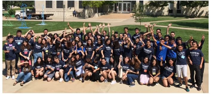
Washburn's New International Students, Fall 2017.

Faculty interested in developing a study abroad may begin the exploration process now by visiting with the Study Abroad Coordinator in the Office of International Programs. To find out more about WU study abroad opportunities visit: www.washburn.edu/iip .